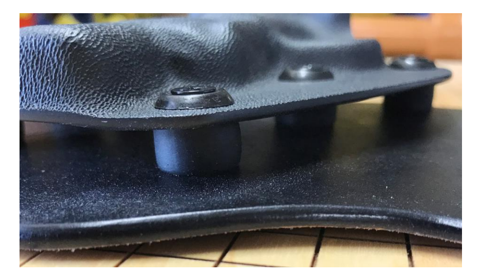
Photo 3 shows finished Kydex edges and rubber spacers for retention adjustment.