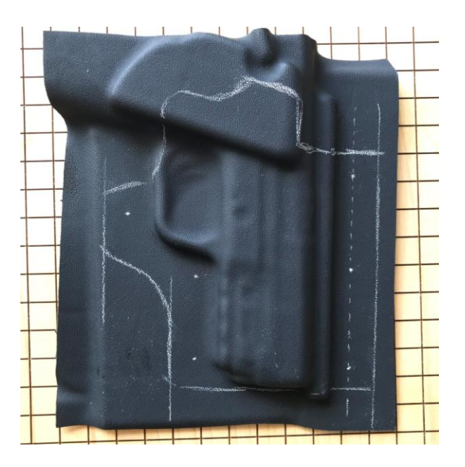
Photo 2 shows Kydex shell formed and rough design with hole placement.